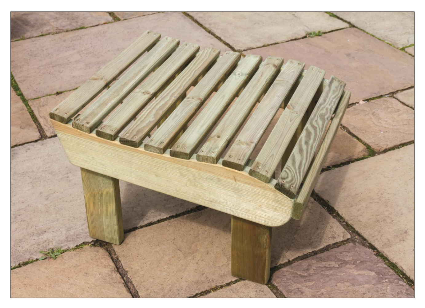
(W x D x H) 0.51m x 0.59m x 0.38m Product Name: Lily Foot Stool

Pressure Treated products should not be treated with any other products for the first month.